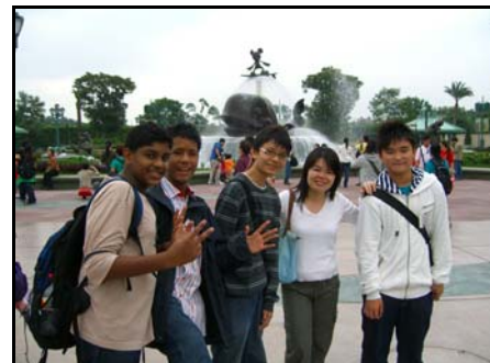
We took our Singaporean friends to Hong Kong Disneyland.

November to 21 November. We had designed a variety of programmes to make their stay here fruitful and memorable. The following are some highlights: