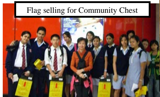
Flag selling for Community Chest