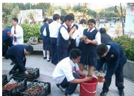
“One Person One Plant” Campaign