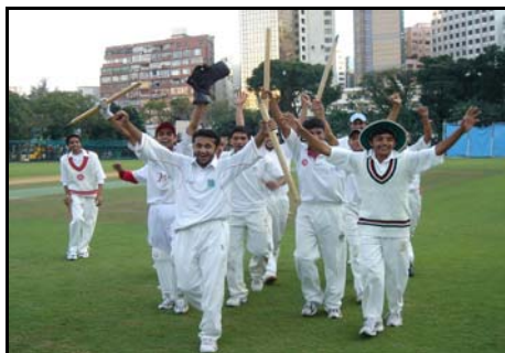
Congratulations to our Senior Cricket Team on winning the "Ted Wilson Trophy" this year.

Just for the record, this is the first time our school has won this trophy since it was introduced in 1976-77.