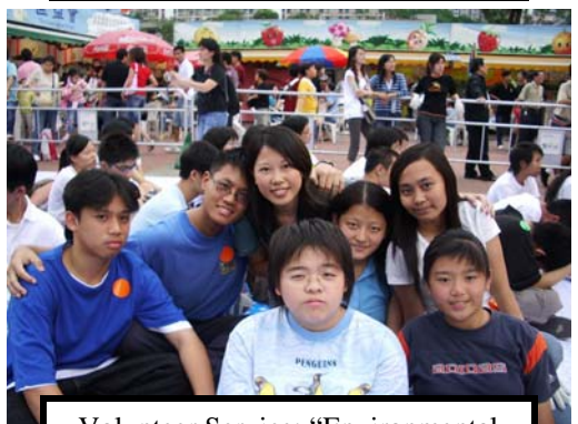
Volunteer Service: “Environmental Friendly Day—New Record”