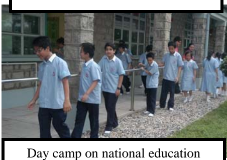
Day camp on national education