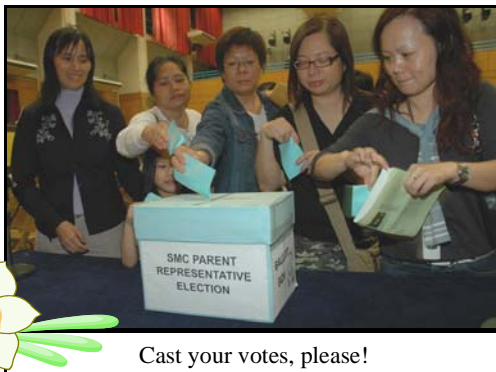
Cast your votes, please!