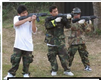
U-Club activity: War game