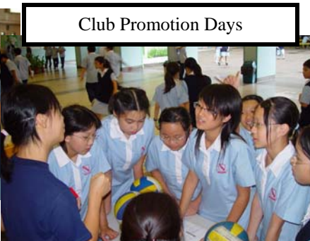
Club Promotion Days