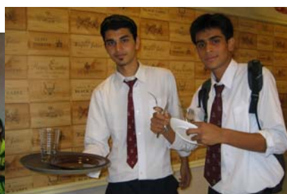
Visit to IVE (Haking Wong)