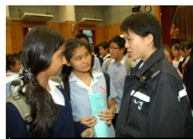
“Real Friends Project”