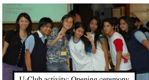
U-Club activity: Opening ceremony