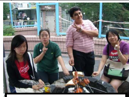
“Making a Rainbow Life”— support programme for non-Chinese speaking and returnee children