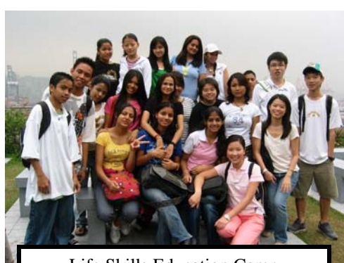
Life Skills Education Camp